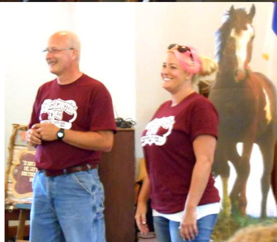
Professional Music Leaders