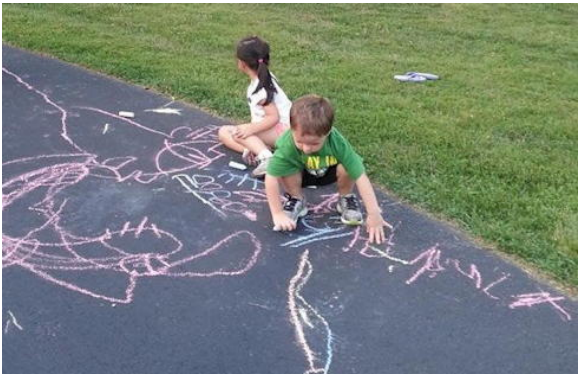
Graphic Designers in Training