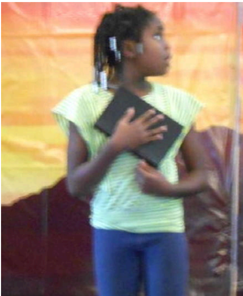
Pledge to the Bible. Love how she held It.