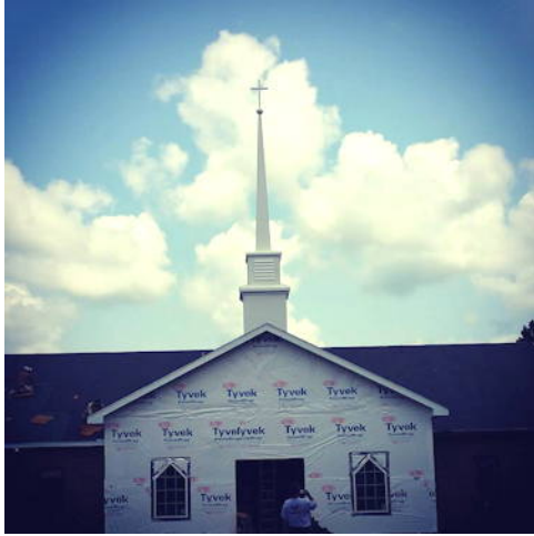
Beginning to look like a real Church building