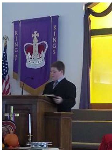
Delivering the Message