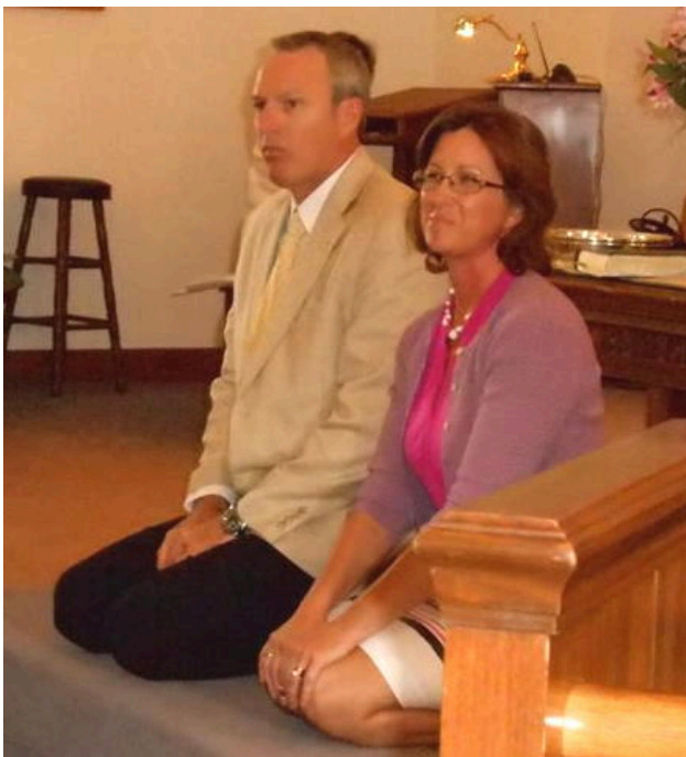
Sorry, I could not help myself