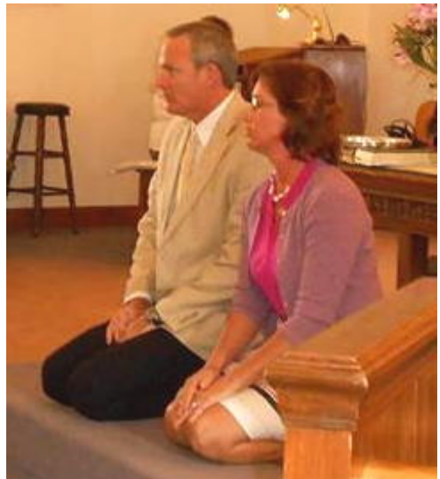
A more appropriate picture