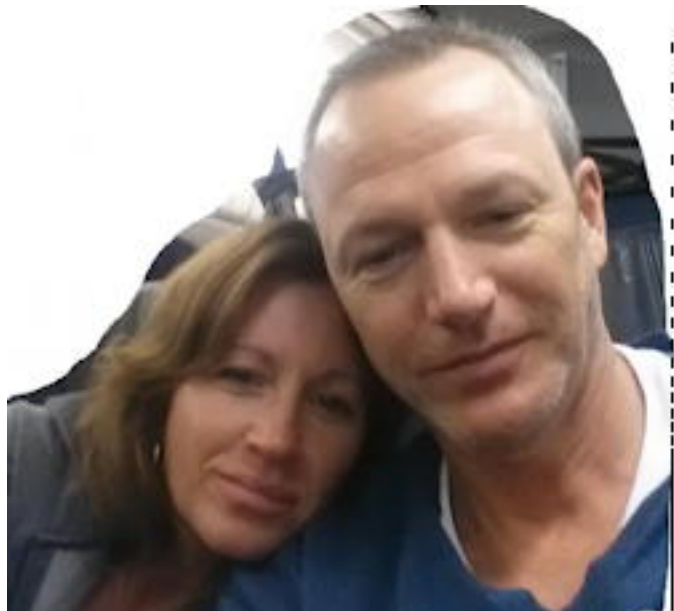
Our New Deacon with our Missions Committee Chairwoman