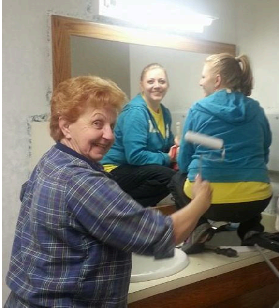
Why were these ladies in the men's room? Hint: there's a paint roller in the picture

If we confess our sins, He is faithful and just to forgive us our sins, and to cleanse us from all unrighteousness 1 John 1:9